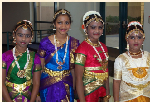
Young dancers from Sankranti Festival

In addition to Hope Abides, several vendors and organizations had tables or booths. There were representatives from local robotics teams, travel agents, religious organizations and other area businesses. Additionally, there was a crafts table for the younger attendees. The table was doing a booming business as many children sat down to draw or make colorful kites. (cont'd next column)